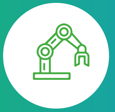
Meetings with potential suppliers of machinery, equipment, raw materials, and various services that are crucial for smooth operations