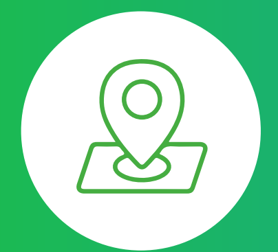
Field visits and comparative tours to relevant companies, allowing the investor to evaluate successful operations in the country